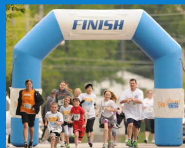
For a group of young runners it is an exciting moment to cross the Spring Sprint finish line.